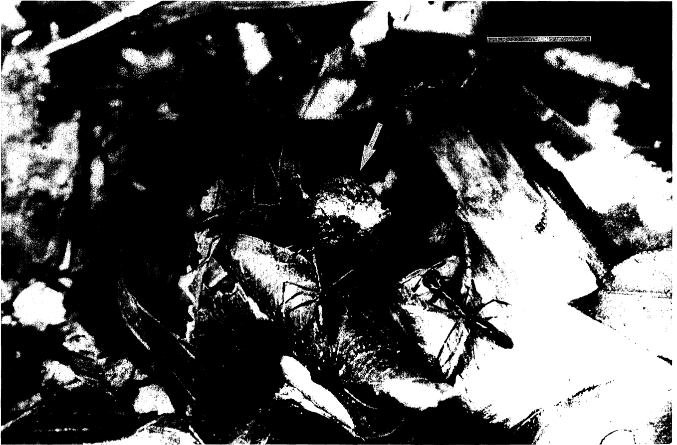
Fig. 1. Workers of Odontomachus chelifer gathering at an arillate seed of Cabralea canjerana (arrow) on the leaf litter of the Atlantic forest of southeast Brazil. The ants eventually carry the seed to the nest, where the aril is consumed by workers and larvae. Bar = 2.0 cm.